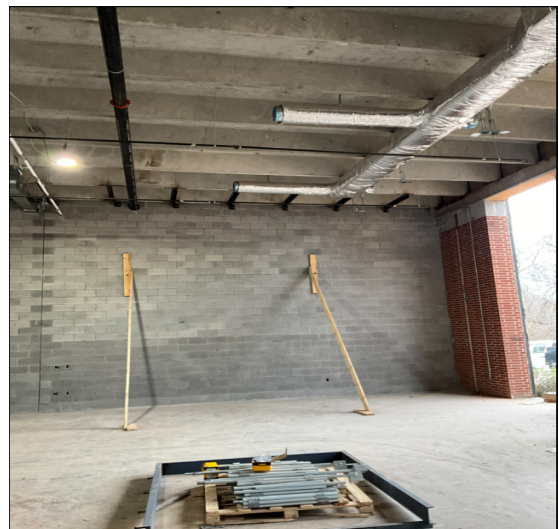
Cafeteria CMU block wall construction is complete