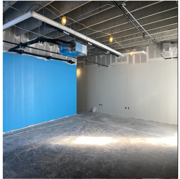
Continue applying paint finishes on level 1 and 2 in area 3