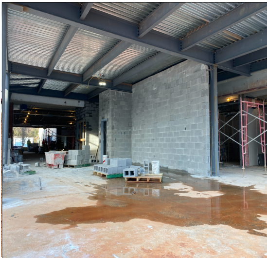
New security vestibule additions CMU walls are constructed and Structural steel has been installed. Roof deck is complete as well.