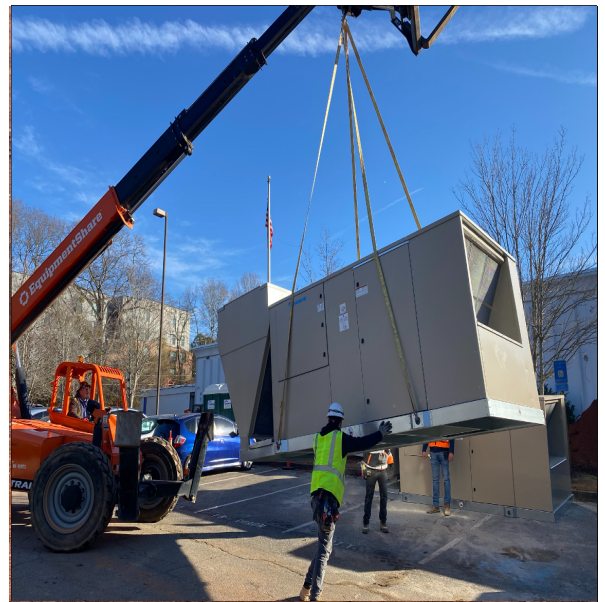
90% of the Doas units are on site.