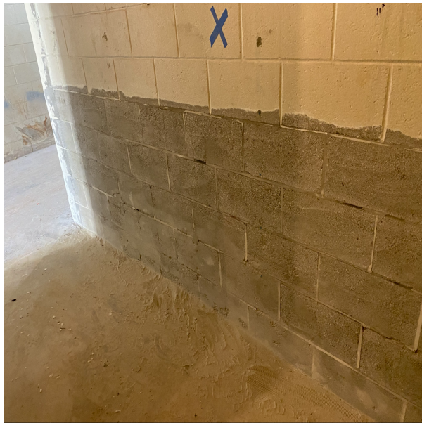
Sanding existing CMU block wall with old ceramic tile mortar