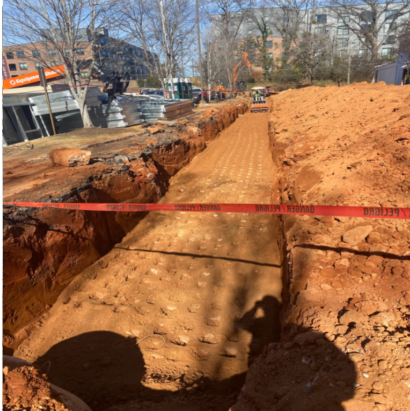
Continue backfill for new sanitary sewer and water line.